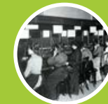
TELEPHONE EXCHANGE (Tivadar Puskás, 1881)