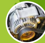
DYNAMO (Ányos Jedlik, 1861)