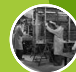
VON NEUMANN ARCHITECTURE OF COMPUTERS (János Neumann, 1944)