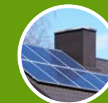
PASSIVE HOUSE (Mária Telkes, 1948)