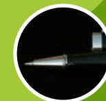
BALL-POINT PEN (László Bíró, 1931)